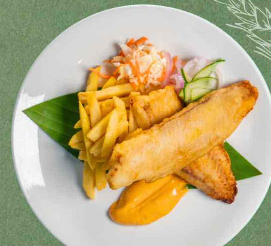
"MORE BATTER" FISH & CHIPS $11.80