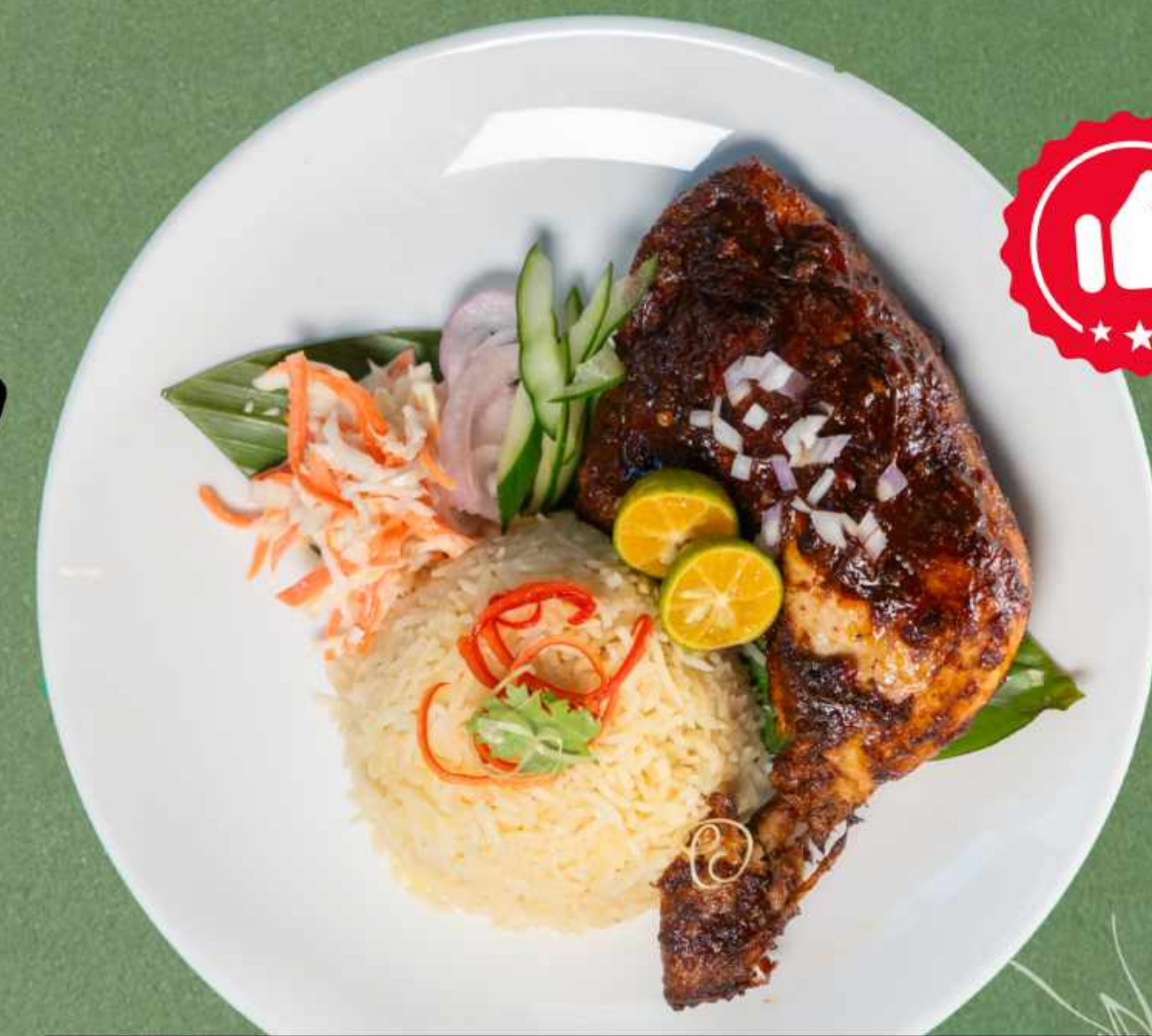
"PANG GANG LOH" CHICKEN LEG W BUTTER RICE | $9.80