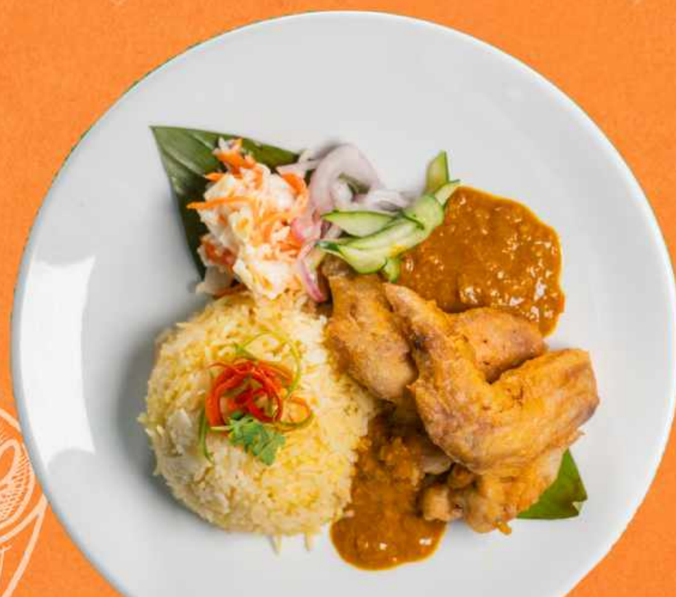
STEADY CHICKEN WINGS W BUTTER RICE | $7.80