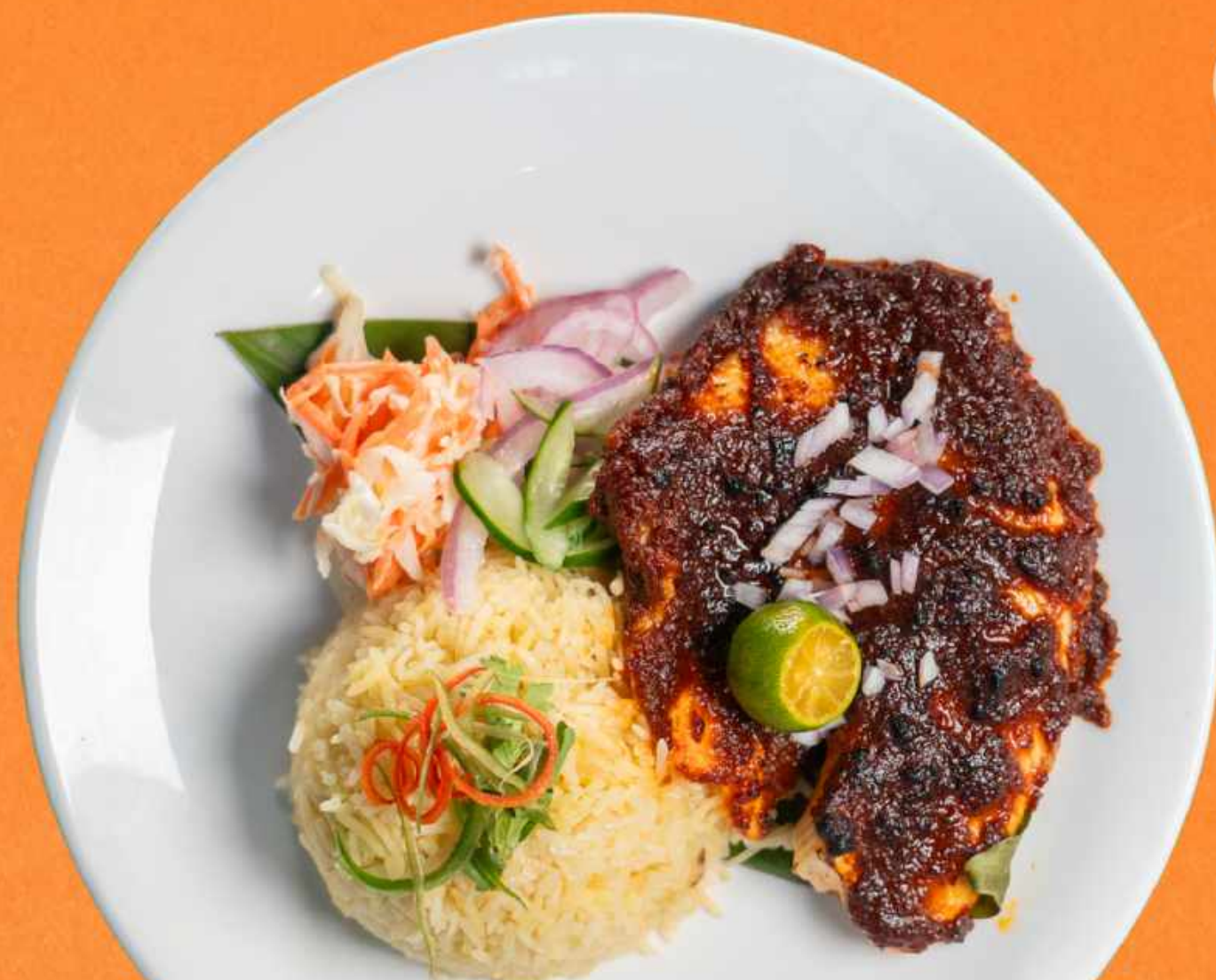
"ATAS SIKIT" SAMBAL FISH W BUTTER RICE | $12.80