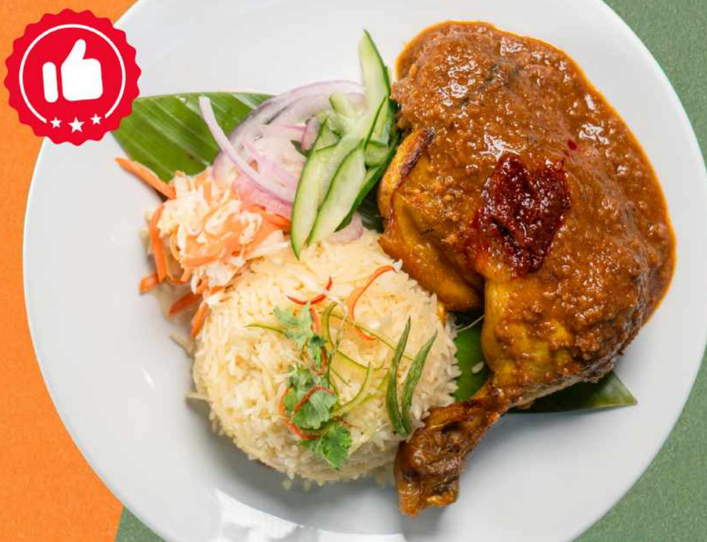
SEXY SATAY CHICKEN LEG W BUTTER RICE | $9.80